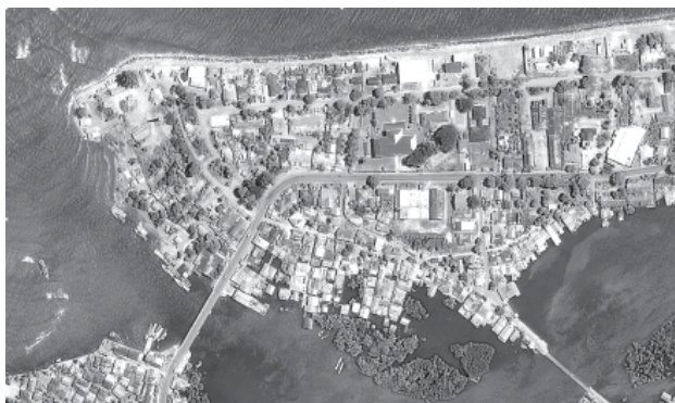
Band Aceh, June, 2004