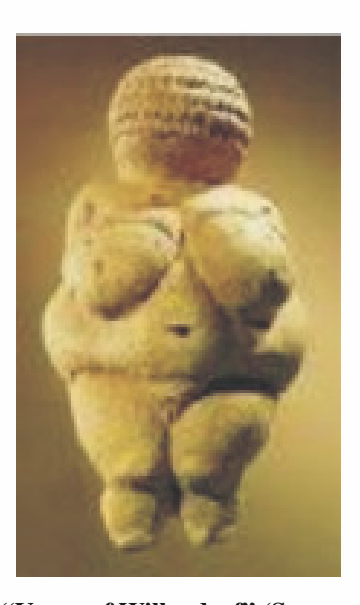
Fig. 4.1: Home Art of the "Venus of Willendorf"

It is however, important to note that sites like Brassempouy (France), Willendorf (Austria) (Fig.4.1), Grimaldi (Italy), Kostienki, Menzin and Malta (all in USSR) show multiple occurrence of the statuettes and hence can be considered archaeologically significant.