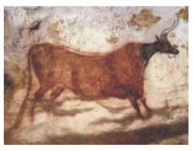
Fig. 4.2: Cave Art at Lascaux

The reindeer, which are best represented, constitute the biggest figures in the panel. These are drawn facing each other. One of these is a female shown kneeling on its forelegs, the other is a male shown with a bent head nuzzling or sniffing the head of the reindeer. Both these animals are first engraved and then a reddish-brown wash is given to fill the inside. Black colour is finally used to give the contour effect in the bodies. The antler of male is painted in black while the horns of the female are painted in red. The rest of the drawings in this cave, which represent different animals, are equally good. Lascaux (Fig. 4. 2) is the finest of all cave-painting sites in France.